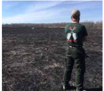
The Ecological Management Crew works on a number of projects, including prescribed burns (above) and invasive species management.

KNC's Ecological Services Team seeded 15 acres of native plants on properties in Barry, Kalamazoo and Kent Counties. We source our seed from our local supplier and partner, Native Connections. We planted both short and tallgrass prairie species that will support pollinator insects and provide beauty and interest for land owners. Plants like butterfly milkweed, wild bergamot, little bluestem, and side-oats grama will require little maintenance once established and will thrive for many years into the future.