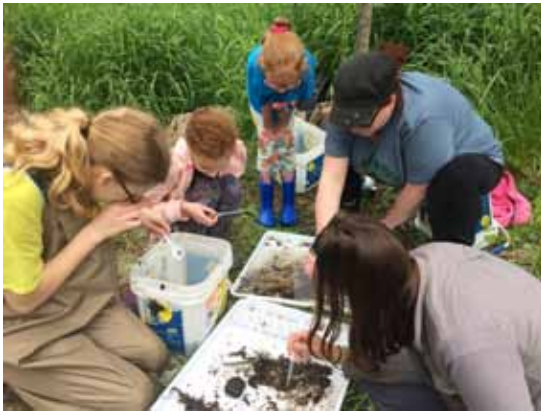
Kalamazoo River Guardian volunteers look through their samples during a monitoring event.