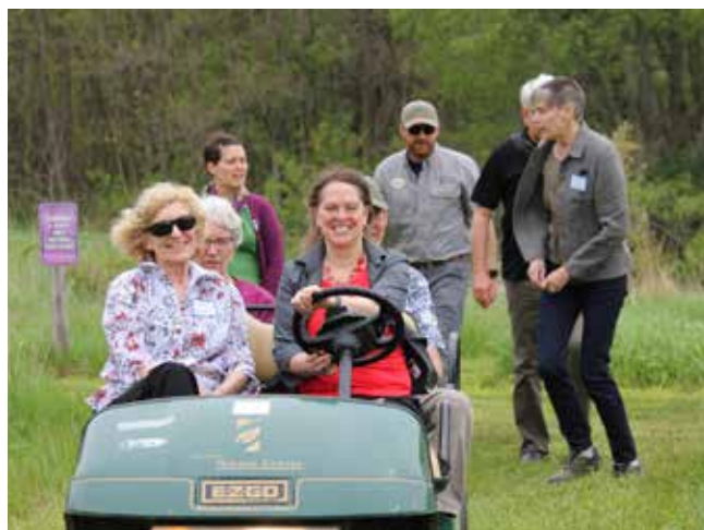
Last October, Cooper's Glen Legacy Members had lunch at KNC Camp before taking a hike to the solar array.